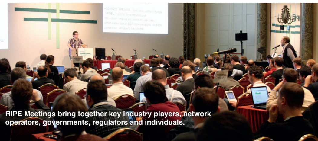
RIPE Meetings bring together key industry players, network operators, governments, regulators and individuals.